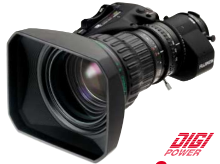
A22 x 7.8 ERM

The A22x7.8 is designed for ENG production with digital servo-controls. The camera operator can virtually tailor the lens to fit individual situations by selecting from a variety of functions using the digitized drive units and servo controls. Features like QUICKZOOM, Auto-cruising zoom,